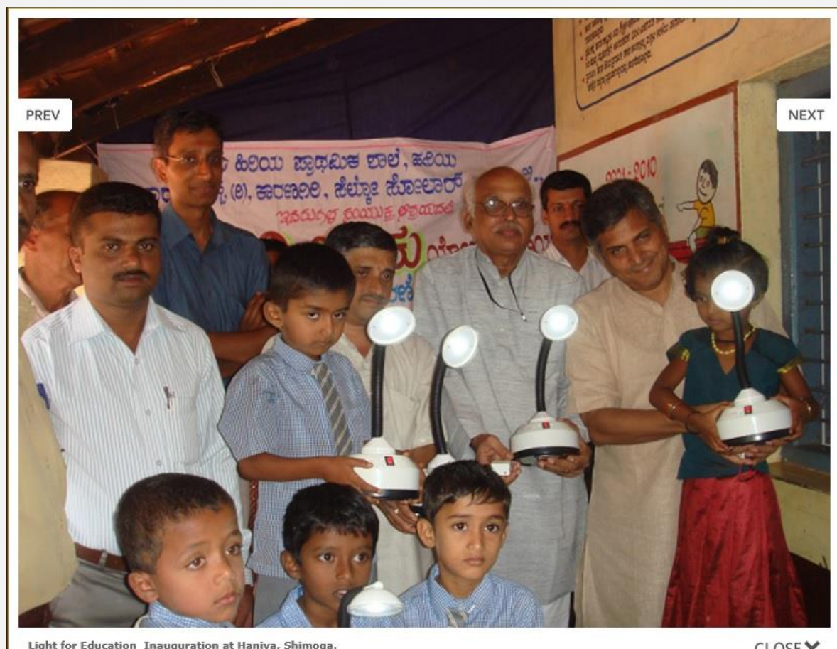
Light for Education Inauguration at Haniya, Shimoga. Image 19 of 58

"Our team is uniquely qualified to operate and grow a company focused on providing sustainable technologies and energy services to rural markets in India and other developing countries. Our leadership has the skills demanded of their positions, significant experience working as a team together, and the blend of passion and commitment required for this business."