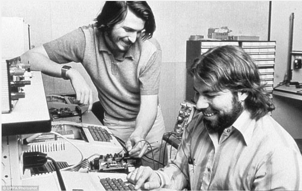
← Apple Founders -1978 Steve Jobs and Steve “Woz” Wozniak